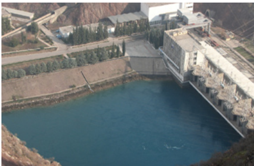
Nurek Hydropower station in the basin of Vashkh river