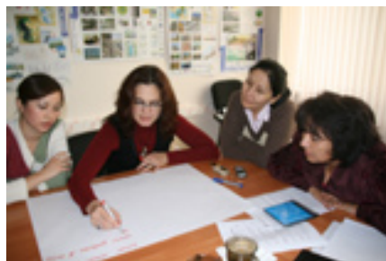
Training participants are completing the task