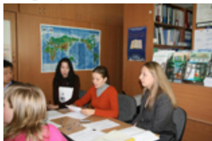
M. Genina and representatives of government, NGOs, and mass media

In 2009 CAREC plans to conduct a number of awareness campaigns, aimed at household waste reduction and liquidation of spontaneous dumps.