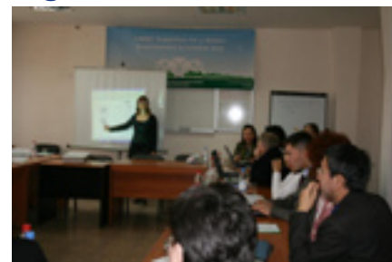
KazNTU students on the workshop