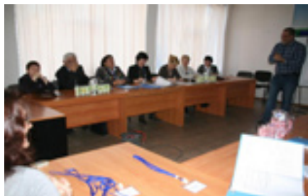
15 environmental NGOs took part in the meeting

Legal subjects in environmental matters were discussed during “Access to justice on environmental matters” training conducted from 13-14 November 2008 in Almaty for 15 environmental non-governmental organizations of Kazakhstan. The training was organized by CAREC with support from the European Commission.