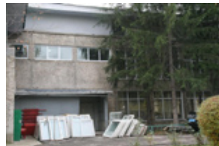
CAREC presented 167 windows to the Kazakh State University al-Farabi

CAREC gratuitously gave 167 used windows to the Biophysical Ecological Centre at Al-Farabi Kazakh State University. This activity is run within CAREC Climate Change and Sustainable Energy Programme, which provides a number of actions including the windows replacement with plastic double-glazed units. The windows were made in 1974, but are nevertheless in a good condition and can last several years.